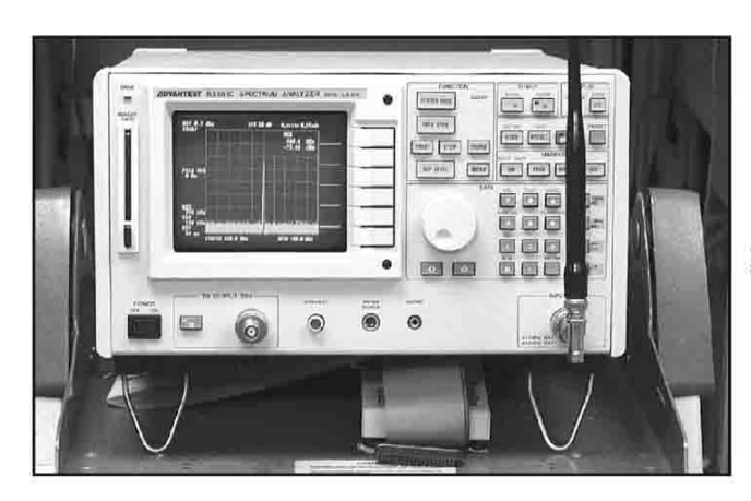
Figure 4—The Advantest R3361 spectrum analyzer used in the test.

Received Signal Strength -38.8 dBm -45.3 dBm -45 dBm -38.8 dBm Difference from Reference 0 dB -6.5 dB -6.2 dB 0 dB