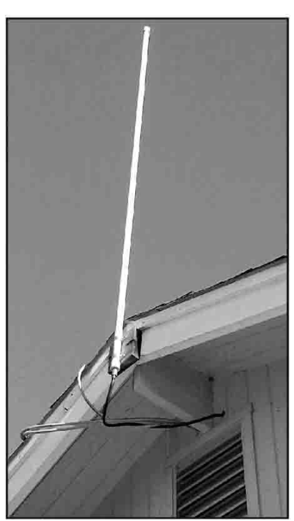
Figure 5—The completed antenna mounted to the roof.

If you do not have the equipment to construct or tune this antenna at both VHF and UHF, the completed antenna is available from the author, tuned to your desired